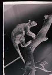
Lumholz tree Kangaroo. 1 sec @ f4/2.8