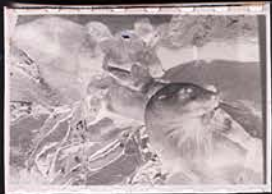
Seals 1 sec @ f4/2.8