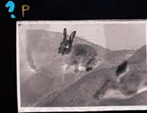
Rabbits 1 sec @ f4/2.8