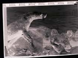
Seals 1 sec @ f4/2.8 @ 2.8/1.8