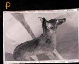
Fox 1 sec @ f4/2.8