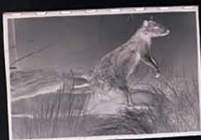
Brush tailed rock Wallaby 1 sec @ f4/2.8