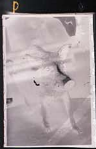
Pig 1 sec @ f4/2.8