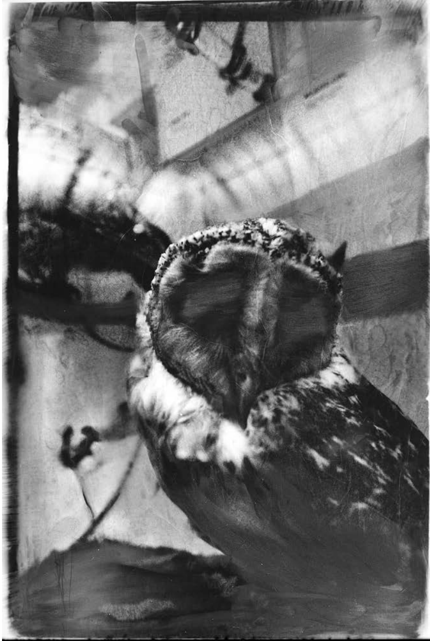
Melita Dahl Untitled (Owl)

From the series Museum of Silence (1991)