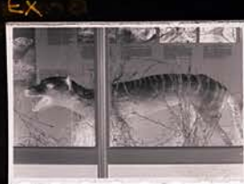
thylacine 1 sec @ f4/2.8