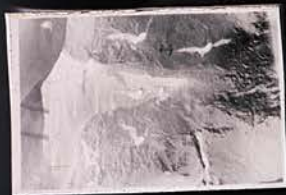
bats 1 sec @ f1.8