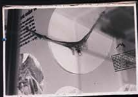
black flying fox 2 sec @ f1.8