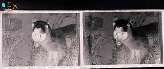
Thylacine f4 for 1 sec f2.8 for 1 sec

Ex - Extinct En - Endangered. P - Predator or Pest