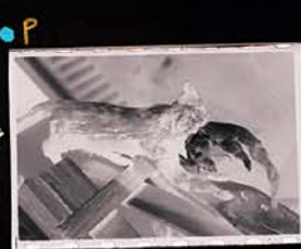
Cat & Rat 1 sec @ f2.8