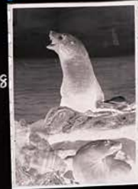
Seal 1 sec @ f4/2.8