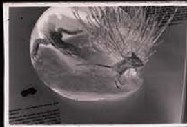
Spinifex hopping Mouse 2 sec @ f2.8